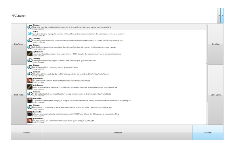
Fig. 2. Screenshot of HAIL twitter client. The large buttons around the edge are used to interact with the social networking site. The middle of the screen is a non-interactive display area. We integrated posting of automatically generated social networking messages within this program.

for this purpose. Without logging functionality, or the ability to modify the programs themselves, there is only a limited amount of information that an automatic message generator can access. One option is to log the active application window title. Another option is to take screenshots at certain times, and then present those screenshots as options to include in the online social networking message. In either case, users would likely be concerned about privacy issues.